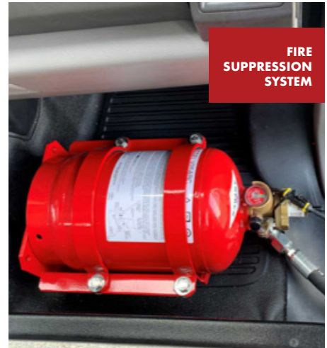
FIRE SUPPRESSION SYSTEM