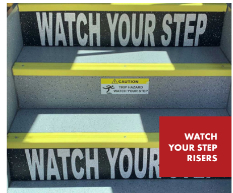
WATCH YOUR STEP RISERS