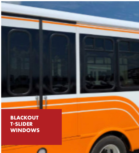
BLACKOUT T-SLIDER WINDOWS