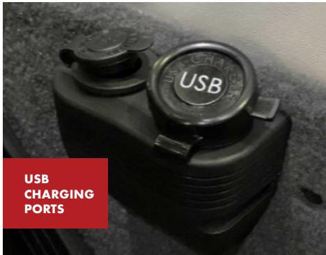
USB CHARGING PORTS