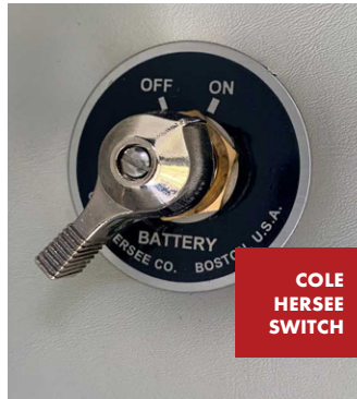
COLE HERSEE SWITCH